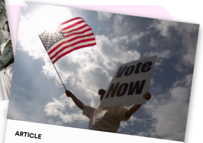
ARTICLE Issue Overview: Voting rights