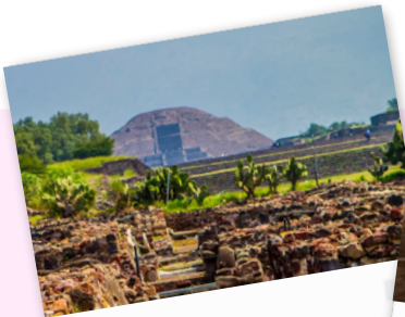
ARTICLE Empires of the Americas