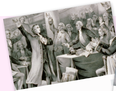
ARTICLE War of words erupts into the American Revolution

The Massachusetts Eighth Grade Social Studies Collection includes texts and lessons curated to support the 8th grade social studies standards, focused on Civics. The Collection also includes resources to explicitly support the MCAS assessment.