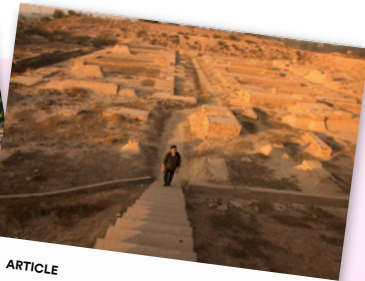
ARTICLE Early Civilization in the Indus Valley