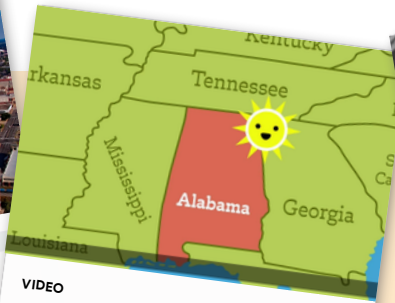
VIDEO Let's go to Alabama