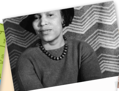
ARTICLE Writer Zora Neale Hurston, a central figure in the Harlem Renaissance