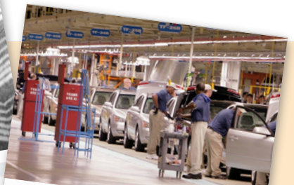
ARTICLE How Alabama is becoming the auto capital of the South

Each collection includes a unique and robust set of resources that enable teachers to deliver the content in a meaningful way.