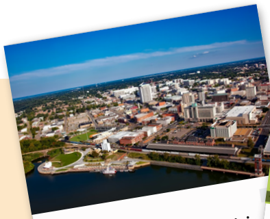
ARTICLE Alabama: The Heart of Dixie

The Alabama State History Collection curates content aligned to AL's 3rd grade state history standards, with instructional resources that support teachers to help young learners engage with the material.